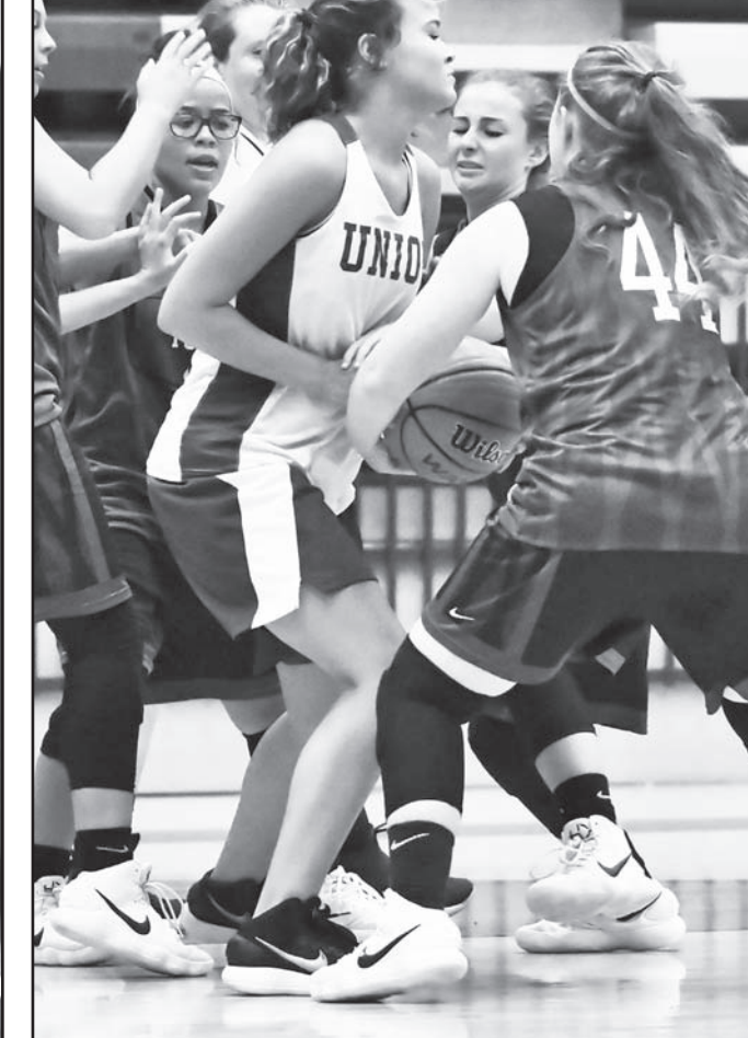
Union County basketball camp photos by Todd Forrest